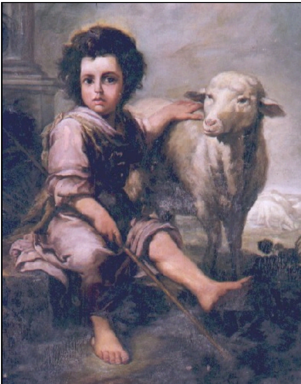
Buen Pastor Niño (19 th century), after Bartolomé Esteban Murillo (1617–1682)

Fourth Sunday of Easter (Year A) Fourth Week of Eastertide